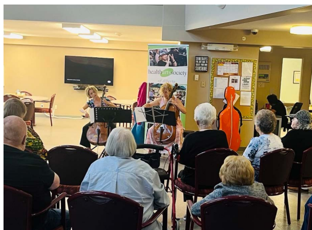
Musicians perform for seniors in Fort McMurray