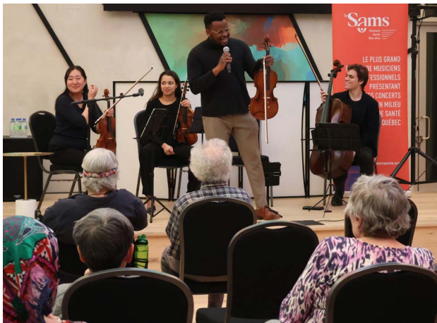
Le quatuor à cordes de l'Ensemble Obiora en résidence pour aînés