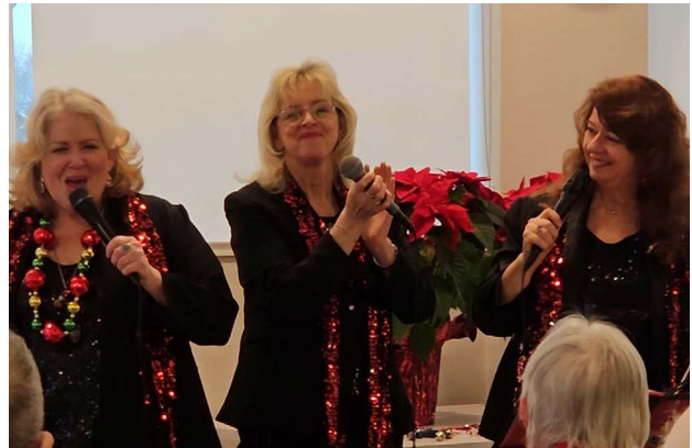
The Holiday Carolers raise resident spirits at Canterbury Place Retirement