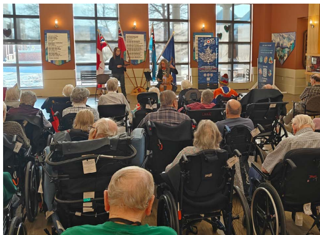
Musicians perform at CapitalCare Kipnes Centre for Veterans