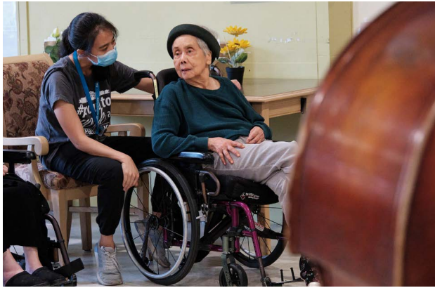
Fairview Nursing Home resident and staff member share a moment during a CiCO concert