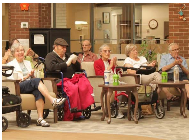
Audience members at Canterbury Foudation enjoy a performance