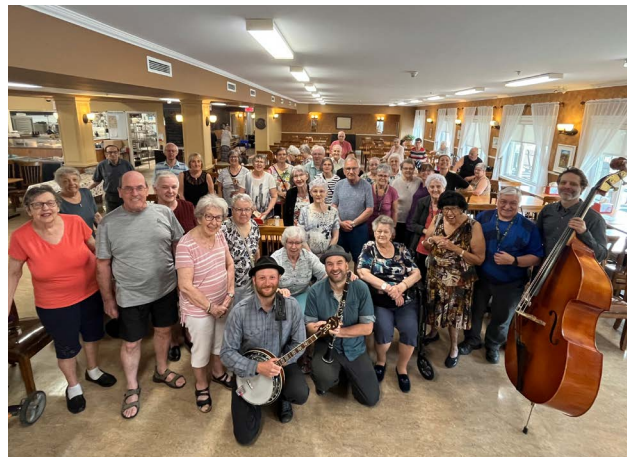
Le Early Jazz Band en tournée dans les résidences et CHSLD de l'Abitibi-Témiscamingue