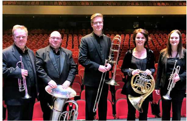
Big Sky Brass