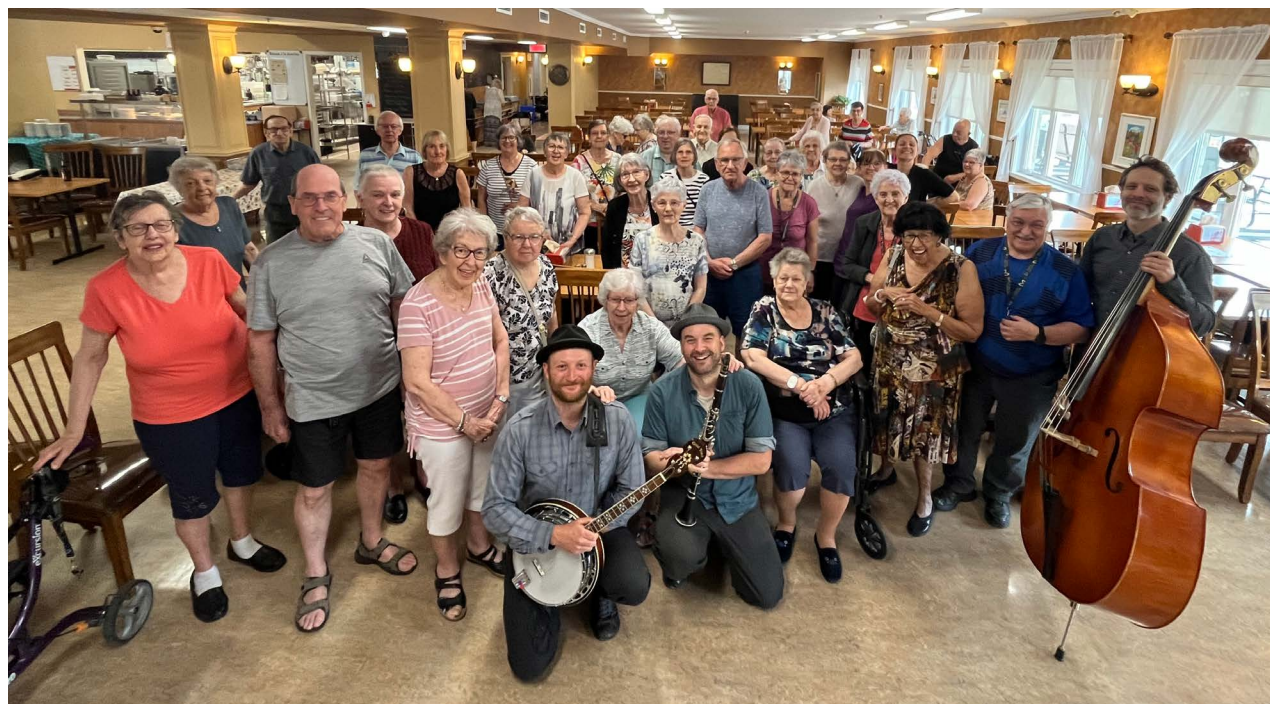
The Early Jazz Band with residents at a long term care facility in the Abitibi-Témiscamingue region of Quebec