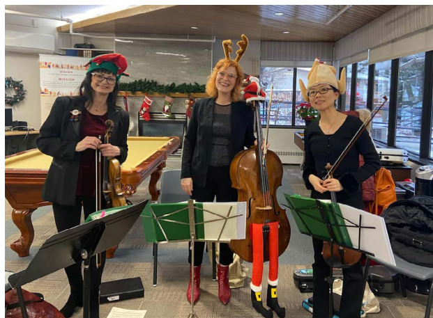
The Obsessions Trio adds some Holiday cheer to a December concert